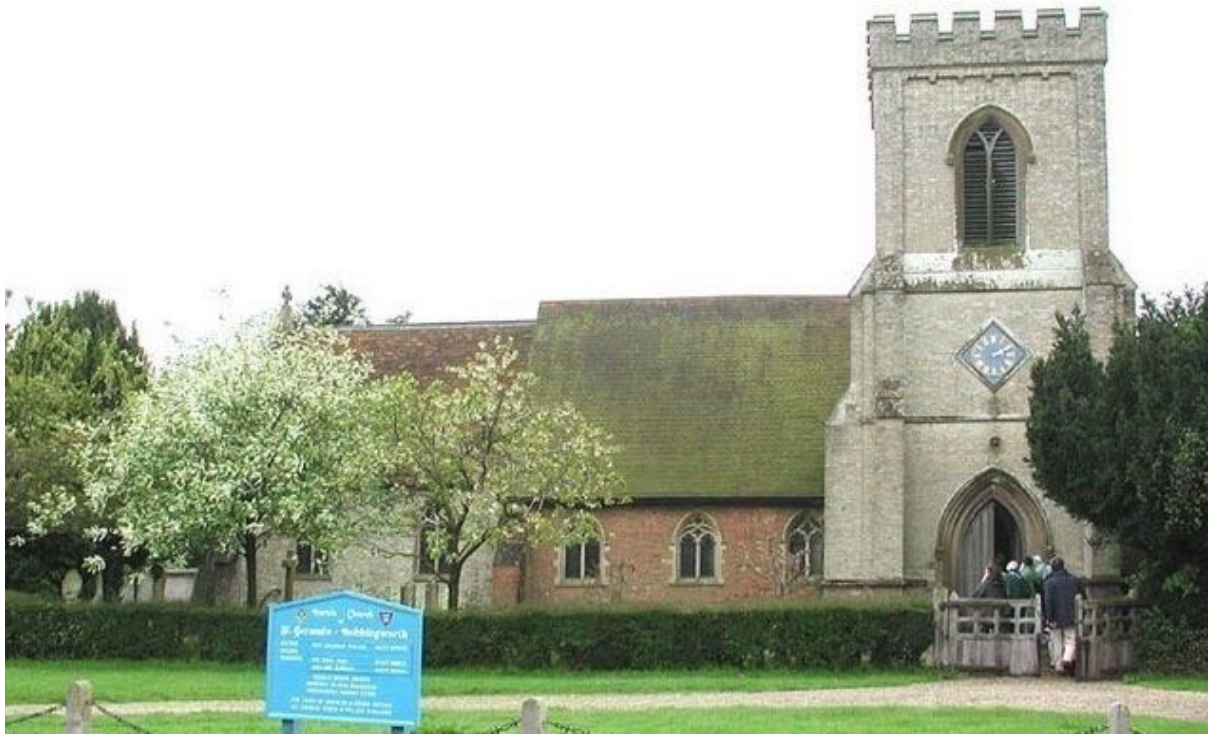
St Germain's Church

Bobbingworth also known as Bringer and also referred to as Bubbingworth