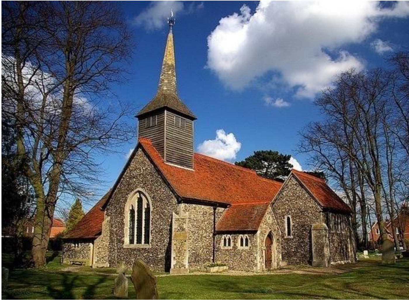
St Mary the Virgin